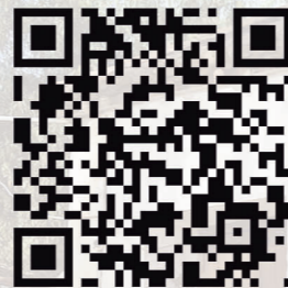
Casa del Cura